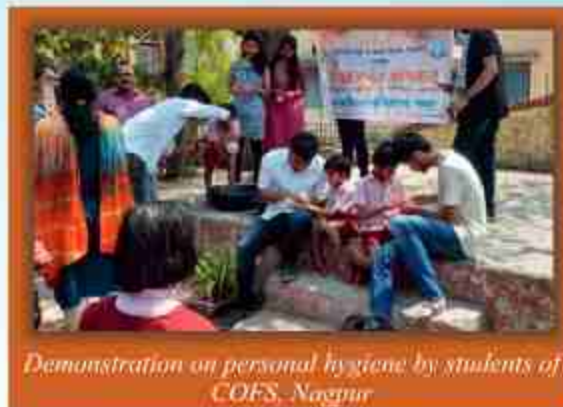
Demonstration on personal hygiene by students of COFS, Nagpur