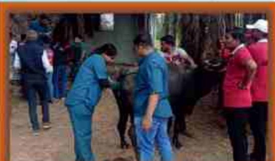
Experts examining animals during camp