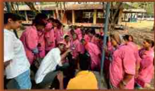
Demonstration on identification of age of goats at MVC, Mumbai