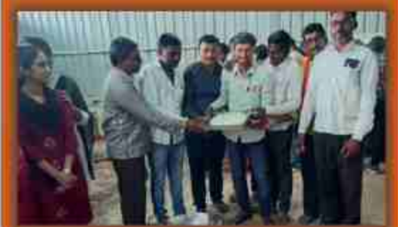
Demonstration of Paneer preparation