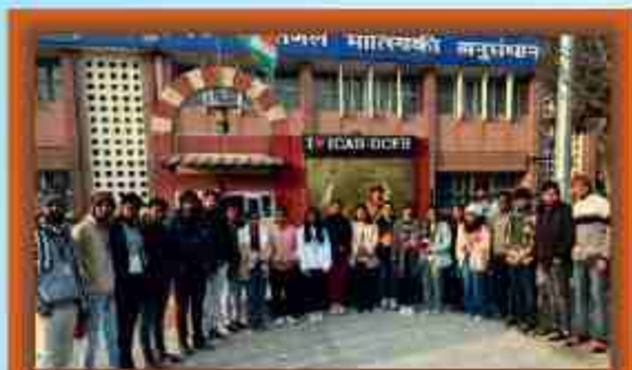
Study Tour of B.F.Sc. students of COFS, Nagpur

The study tour of final year students of the College of Fishery Science, Nagpur undergoing Student READY programme to the fisheries institutes in North India was organized during 19 th January to 04 th February 2024.