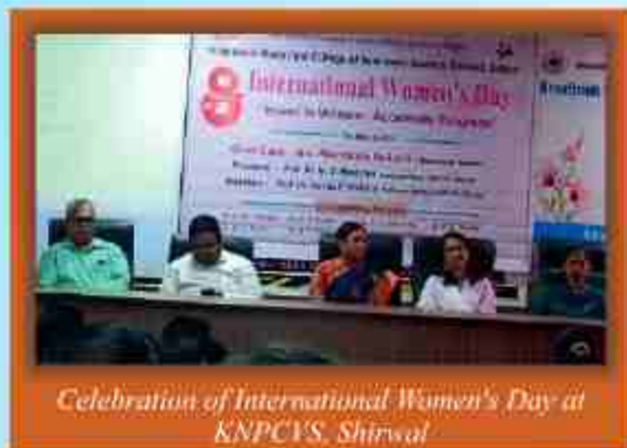
Celebration of International Women's Day at KNPCVS, Shirwal