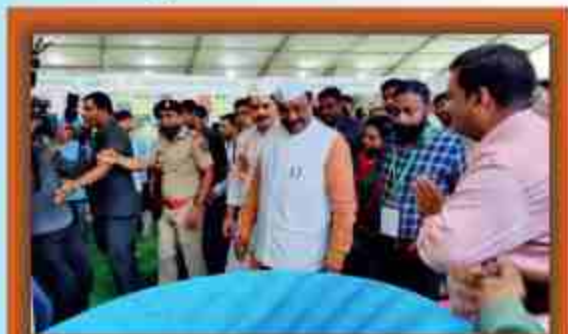
Visit of Hon'ble Shri. Sudhir Mungatiwar and Hon'ble Shri. Dhananjay Munde to the college stall

The College of Fishery Science, Nagpur participated in District Krishi Festival organized at Chandrapur during 07 th to 9 th January 2024. The informative material on the fisheries and aquaculture technologies in the form of charts, publications and live models of technologies were displayed by COFS, Nagpur. Hon'ble Shri. Sudhir Mungatiwar, Minister for Fisheries, Forests & Cultural Affairs, Government of Maharashtra and Hon'ble Shri. Dhananjay Munde, Minister of Agriculture, Government of Maharashtra visited the stall. Shri. Arvind Kulkarni, Fishery Field Assistant, COFS, Nagpur and B.F.Sc. students provided knowledge and guidance to the visitors. Dr. Prashant Telvekar co-ordinated the fishery exhibition under the guidance of Dr. S. W. Bonde, Associate Dean, COFS, Nagpur.