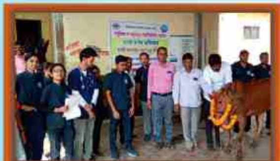
Inauguration of vaccination and spraying camp at Pimpri