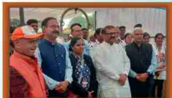
Dignitaries during the inauguration of camp