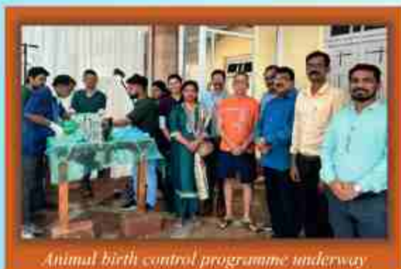
Animal birth control programme underway