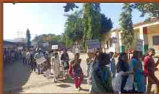
Swachhata Janjagran Rally at Haibatpur, by NSS volunteers of COFS, Udgir