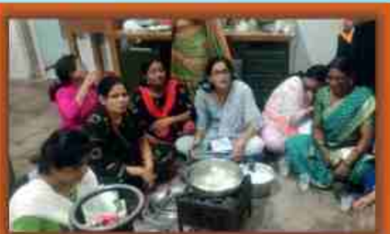
Demonstration of preparation of Rasgulla to SHG women

Training program on 'Dairy Business and Dairy Milk Products' was organized by College of Dairy Technology, Warud (Pusad) for Self help group of womens under Nagar Parishad Arvi from 27 th to 29 th March 2024. Total 20 women participated in the training program. During this training, preparation of various milk products were carried out. Screening of adulteration of milk by using chemical reagents was demonstrated to the participants.