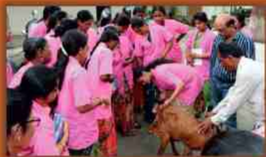
Pashusakhi measuring body temperature of goat at PGIVAS, Akola