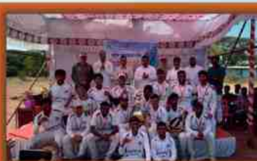
Winner team with trophy