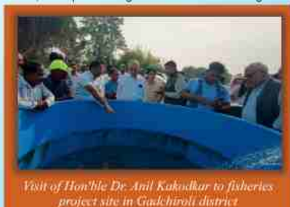
Visit of Hon'ble Dr. Anil Kakodkar to fisheries project site in Gadchiroli district