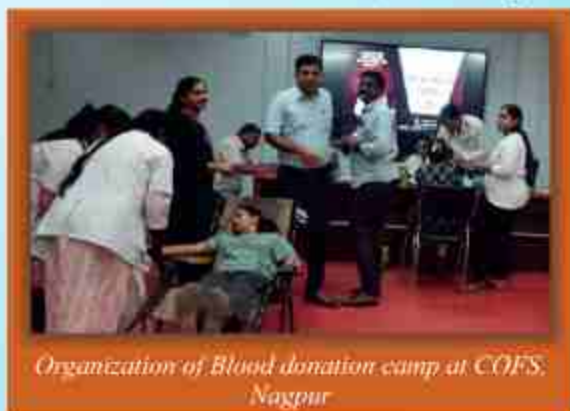
Organization of Blood donation camp at COFS, Nagpur