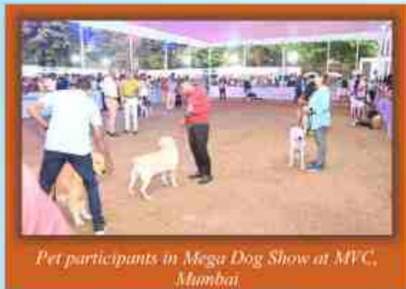
Pet participants in Mega Dog Show at MVC, Mumbai