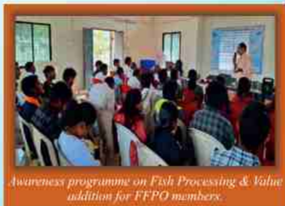
Awareness programme on Fish Processing & Value addition for FFPO members.