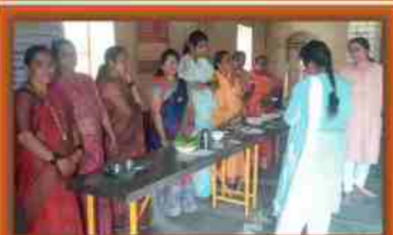
Expert judging millet recipe competition