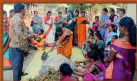
Pashusakhis preparing balanced rations at COVAS, Udgir