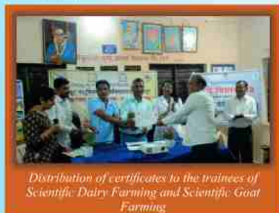
Distribution of certificates to the trainees of Scientific Dairy Farming and Scientific Goat Farming