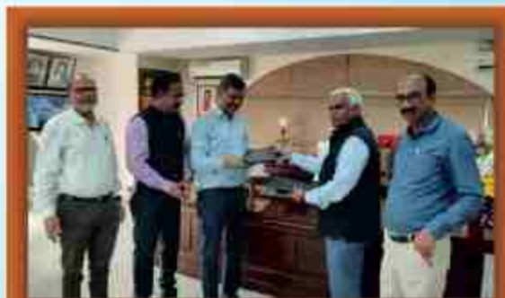
Signing of MOU between WRTC, Gorewada and MZA