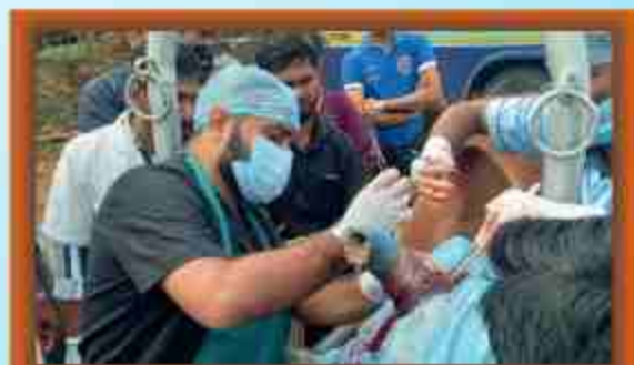
Expert performing horn cancer surgery during camp