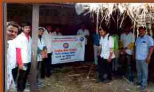
Spraying of animal sheds by NSS volunteers of COVAS, Udgir