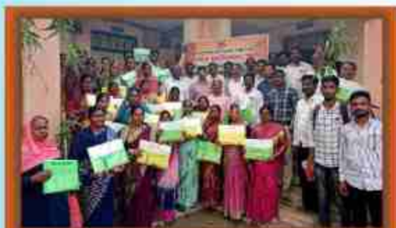
Participants of workshop along with staff of CDT, Udgir