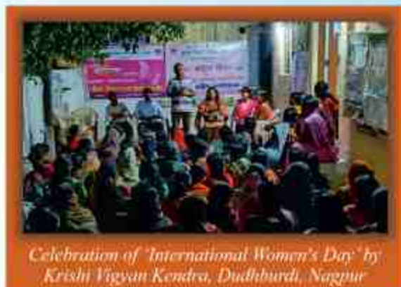
Celebration of 'International Women's Day' by Krishi Vigyan Kendra, Dudhburdi, Nagpur