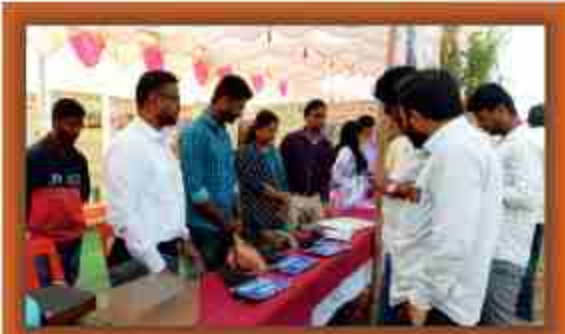
Visit of farmers to college stall