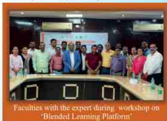
Faculties with the expert during workshop on 'Blended Learning Platform'