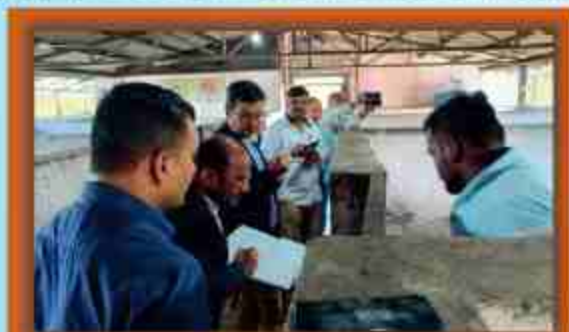
Experts doing survey of breeding tract of Karkambi breed of pigs