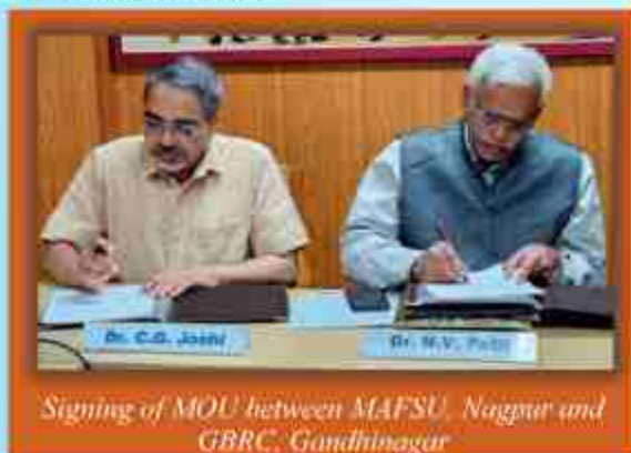
Signing of MOU between MAFSU, Nagpur and GBRC, Gandhinagar