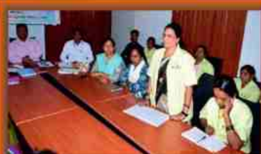
Pashusakhis expressing their views during concluding function of KNPCVS, Shirwal