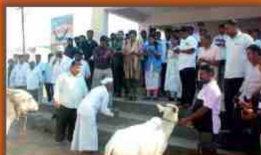
Inauguration of animal health camp organized by KNPCVS, Shirwal