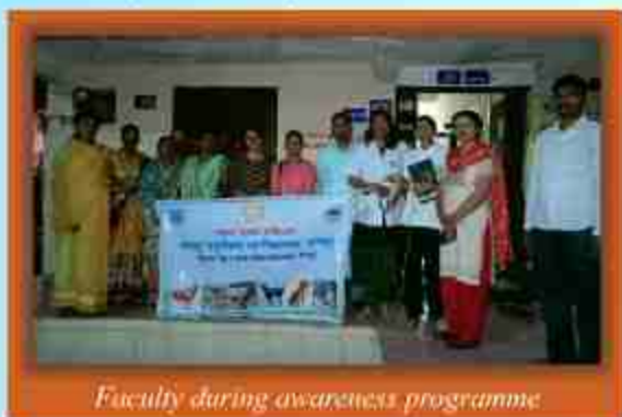
Faculty during awareness programme