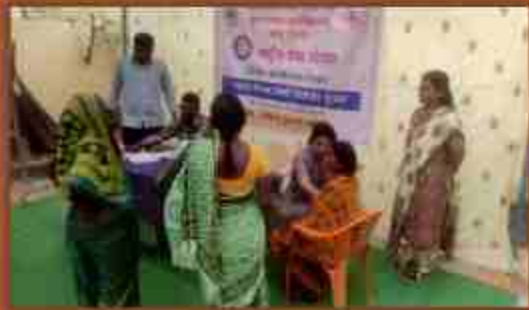
Health Check-up Camp by CDT, Warud.