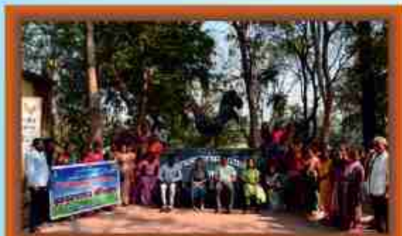
Participants with experts during training programme