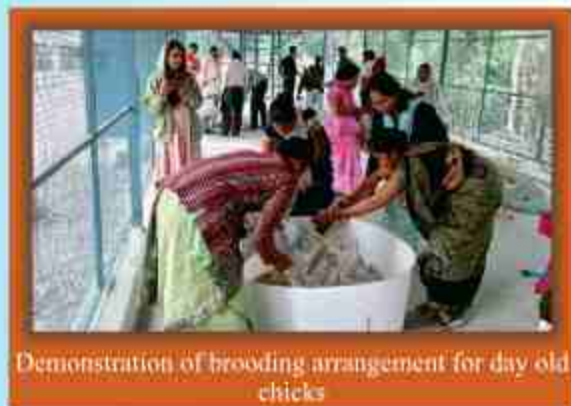
Demonstration of brooding arrangement for day old chicks