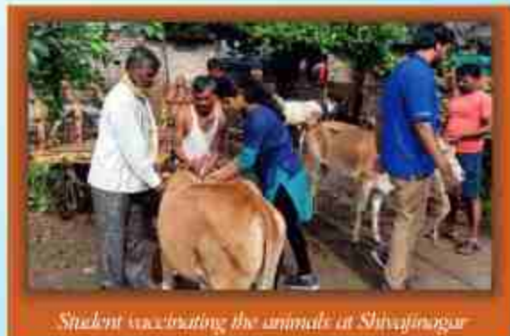
Student vaccinating the animals at Shivajinagar