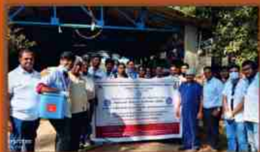
NSS volunteers of MVC, Mumbai ready for vaccination