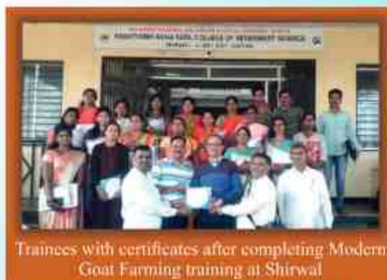
Trainees with certificates after completing Modern Goat Farming training at Shirwal