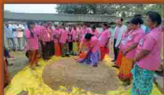
Pashusakhis processing poor quality straw under the guidance of expert at COVAS, Parbhani.