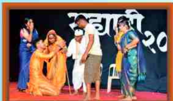
Students of KNPCVS Shirwal performing the drama during the annual social gathering 2024.