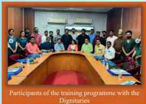
Participants of the training programme with the Dignitaries