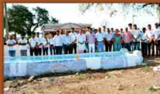
Visit to drinking water tank for animals cleaned by NSS volunteers of NVC, Nagpur