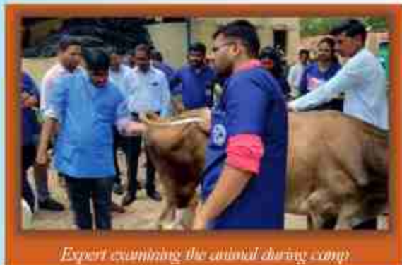
Expert examining the animal during camp